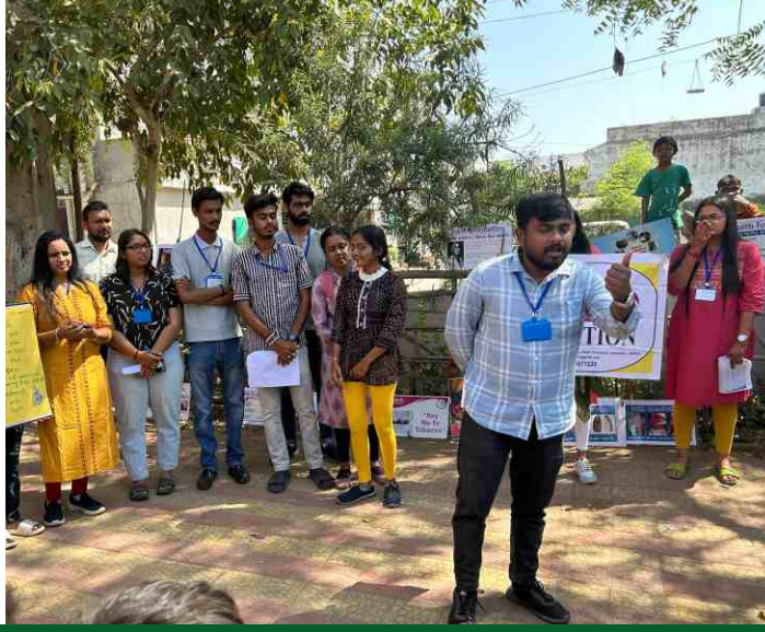
Awareness drive conducted on "No Smoking Day"