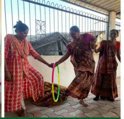
Women's day celebration with Anganwadi staff