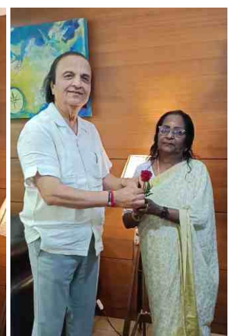
Women's day celebration at Prakash house