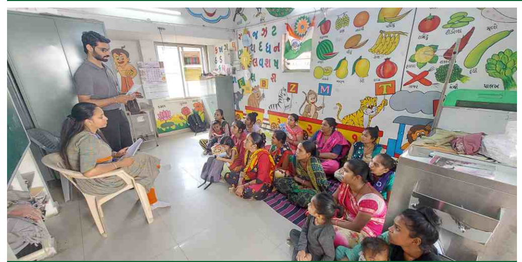
Session with Cervical cancer