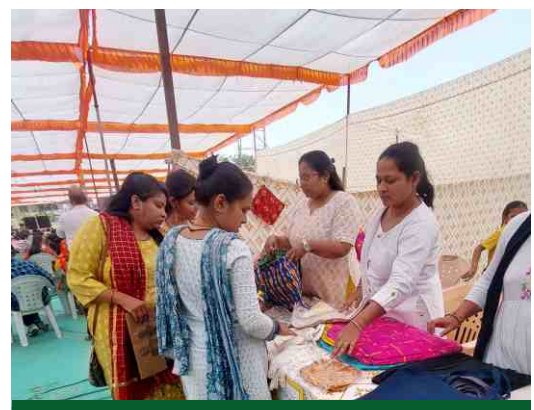
Stall exhibition in Nari Vandan program